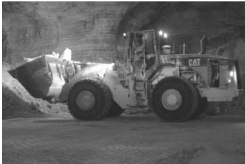
980G Caterpillar Front End Loader 310 Hp

The Detroit Salt Mine decided to run a trial period using 100% Soy Fuel in May of 2004 in it's underground equipment.